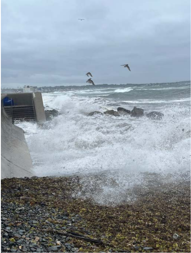
Storm surge 21 Sept 2024