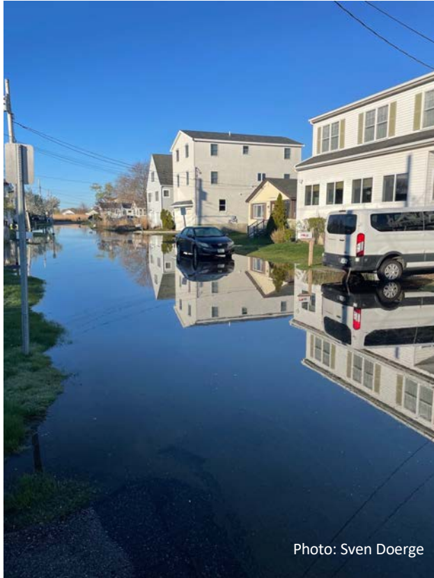
May 11, 2024