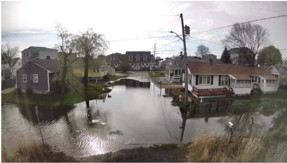
May 8, 2024