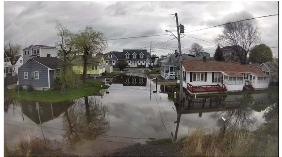
May 9, 2024