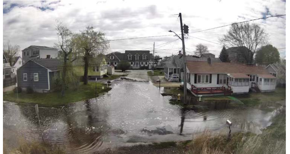
May 11, 2024