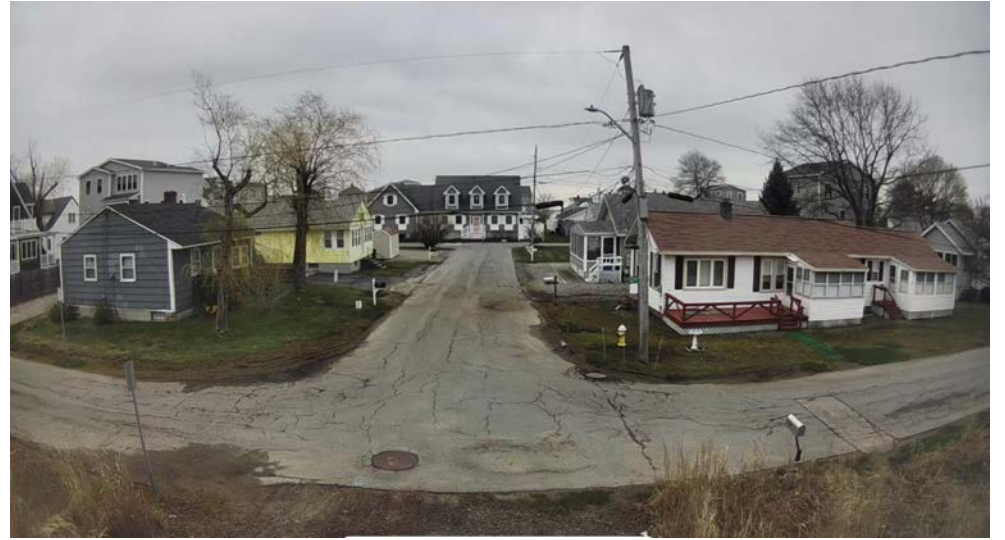
May 15, 2024