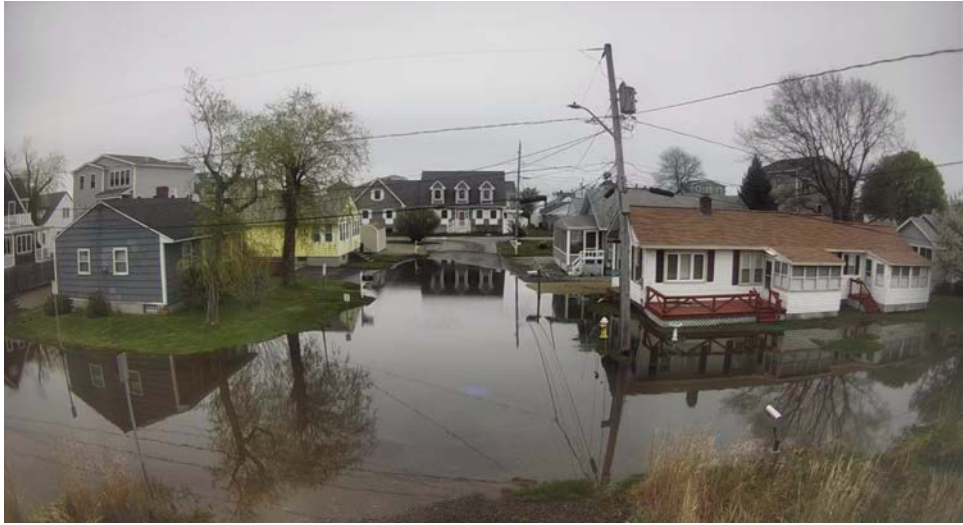
May 10, 2024