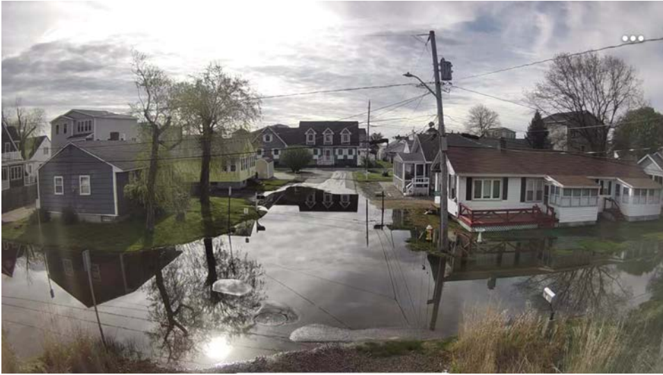
May 13, 2024