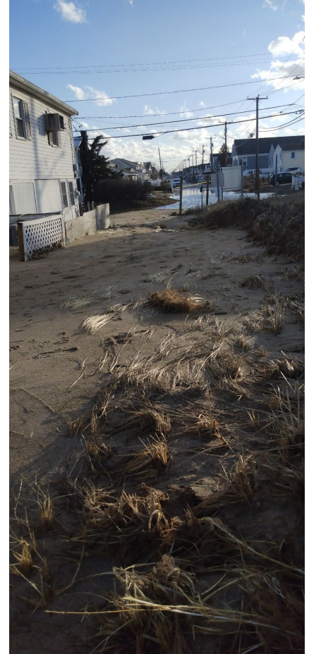
East of IA Bridge: Dune Loss at end of Portsmouth Ave

This view is east of the IA bridge. In the foreground is a sand dune which recent efforts have sought to protect between Eisenhower St & Portsmouth Ave, which run north to south roads. Ocean flooding runs onto Thornton St, an east to west road.