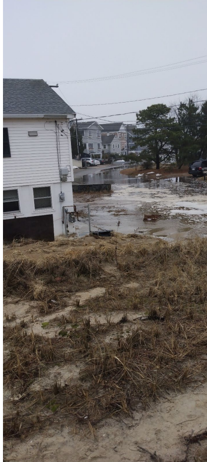
Ocean Flooding East of IA Bridge- Thornton St

This view west shows the last pole of the roped off dune along the sandy path along IA that used to ramp down to the beach. Lost in the storm is beach grass covered dune shown in the section behind the pole continuing to the right edge of the photo. The sandy ramp to the beach is now cut away with a sharp 6-foot drop.