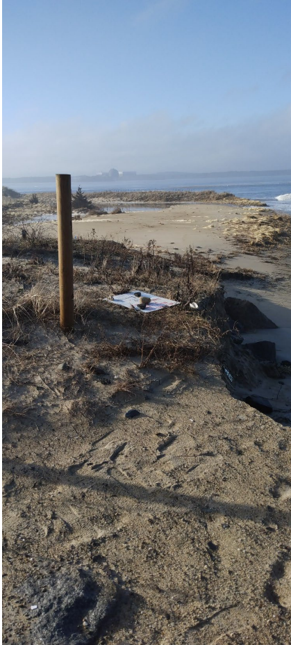
Jan 13, 2024, Storm Photo West of IA Bridge

This view west shows the last pole of the roped off dune along the sandy path along IA that used to ramp down to the beach. Lost in the storm is beach grass covered dune shown in the section behind the pole continuing to the right edge of the photo. The sandy ramp to the beach is now cut away with a sharp 6-foot drop.